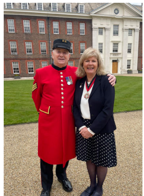
At the Royal Hospital Chelsea with a Chelsea Pensioner during a visit with the Queen Alexandra's Royal Army Nursing Corp