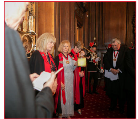
The blessing of the Lamp