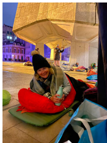
Sleeping out in Guildhall Yard raising awareness and funds for The Lord Mayor's Appeal and homeless charities.